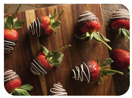
CHOCOLATE STRAWBERRIES $19.99<sub>/LB.</sub>

Treat your Valentine to the perfect blend of sweet, fruity freshness. Available in our Bakery Department.